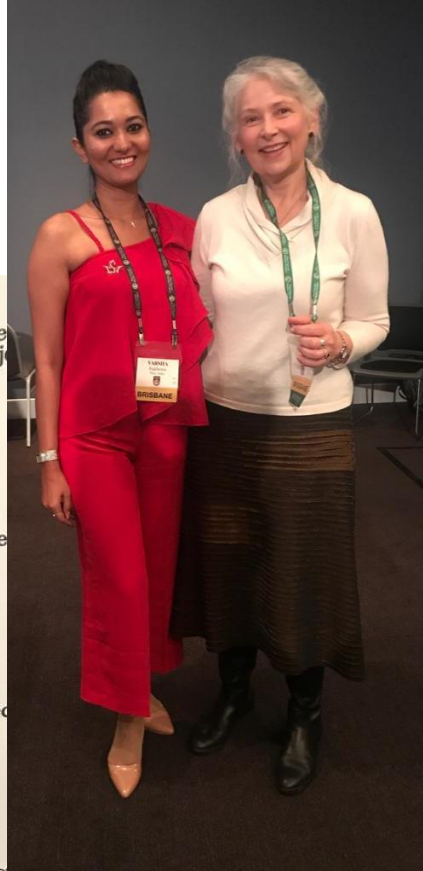
With various International Climate Reality Leaders at the Climate Reality Conference and Training at Brisbane Australia